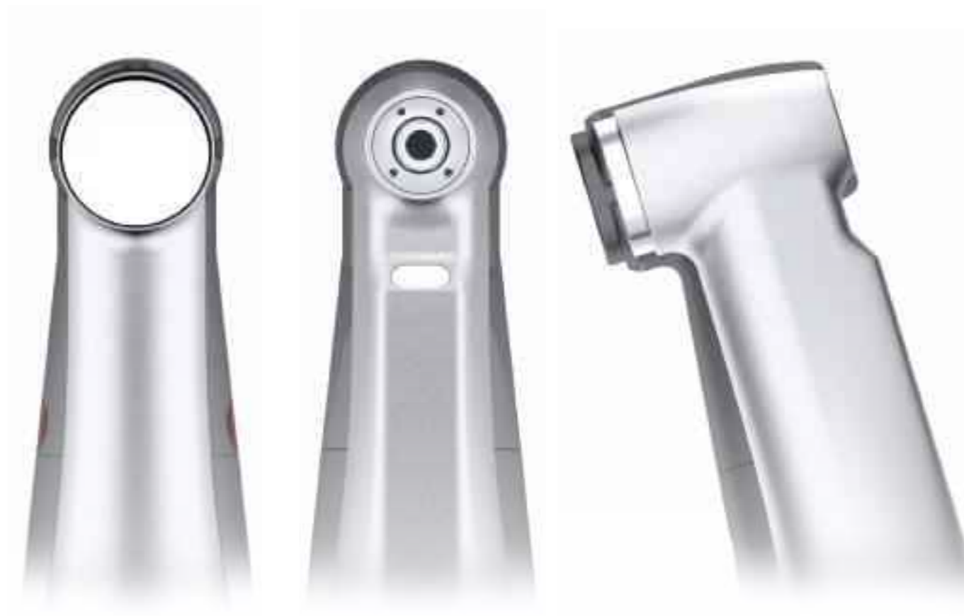
NOVA / CA CLASSIC