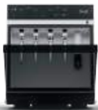
LUBRICARE 2 Maintenance system REF. 1601156-001