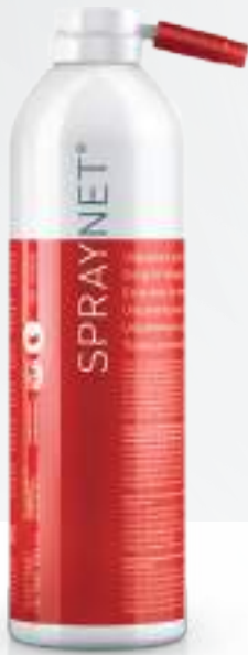
SPRAYNET 500 ml cleaning spray Pack of 6 REF. 1600036-006