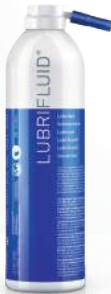
LUBRIFLUID 500 ml lubricant Pack of 6 REF. 1600064-006