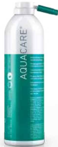
AQUACARE 500 ml cleaning spray Pack of 6 REF. 1600617-006