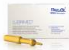
LUBRIMED Pack of 6 cartridges REF. 1600037-006